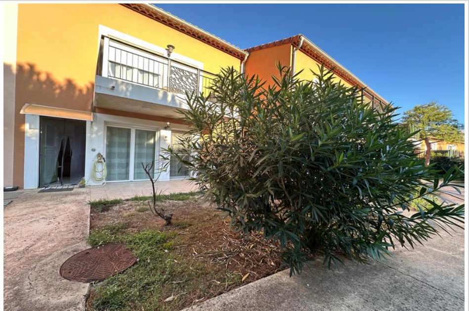
Apartment 116 Cagnes-sur-Mer