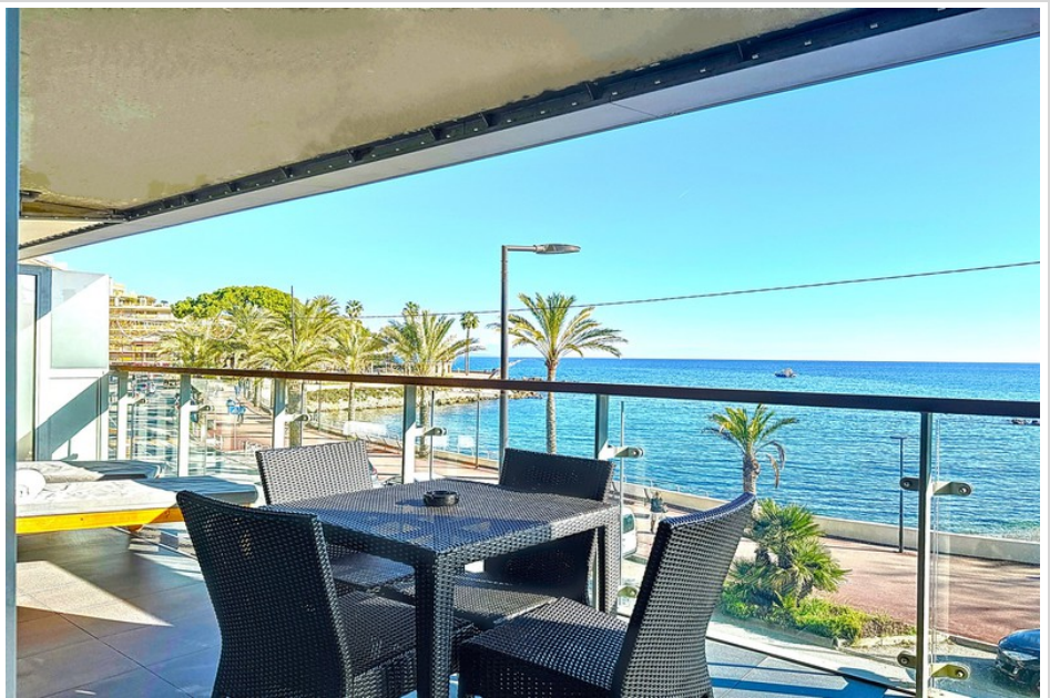
Apartment 5117 Antibes

fees included well condominium(360 lots in the condominium), annual current expenses 50 € (4 € monthly), no current procedure, information on the risks to which this property is exposed is available on georisques.gouv.fr