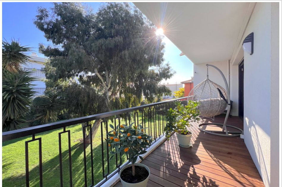
Apartment 5544 Saint-Laurent-du-Var