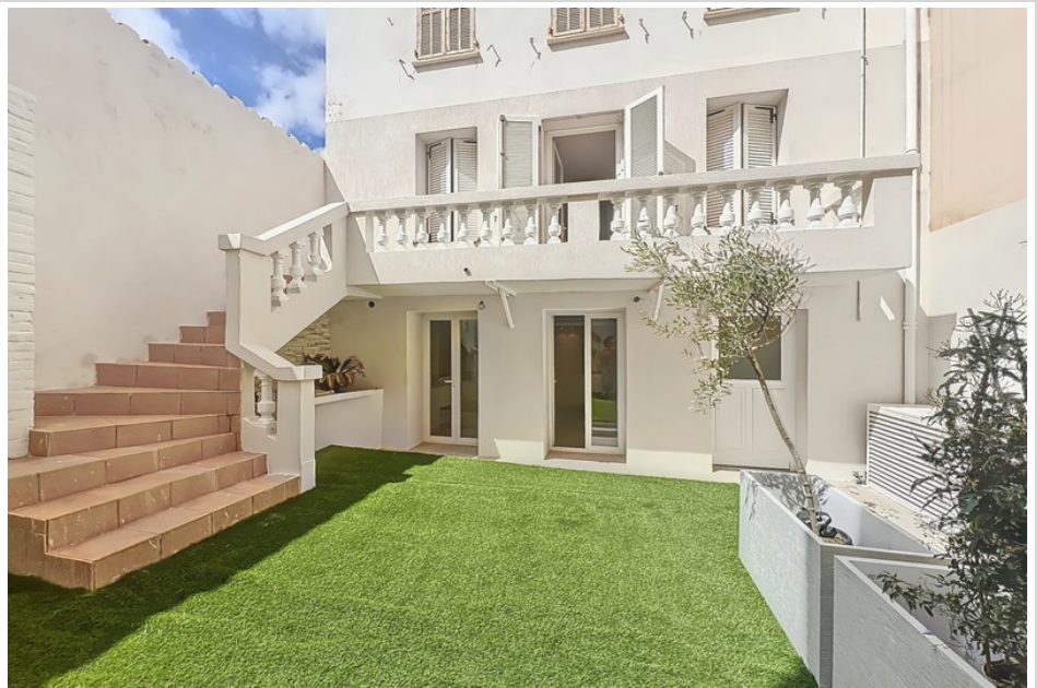
Apartment 281 Cagnes-sur-Mer