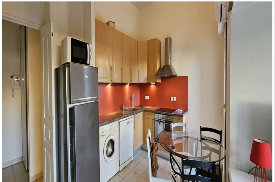
Apartment 25206 Saint-Laurent-du-Var