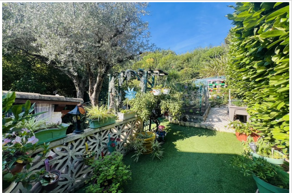
House 711 Gattières