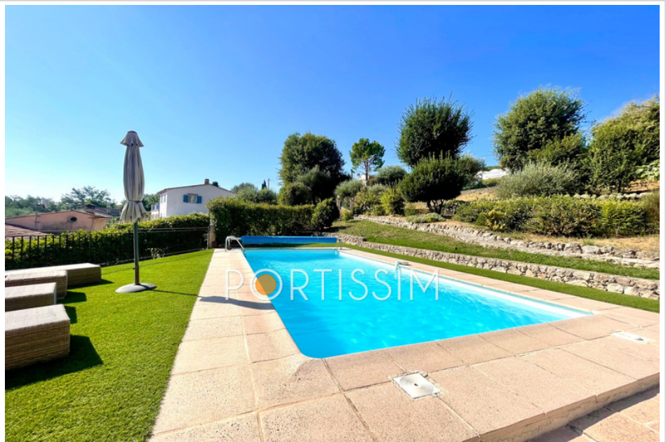
House 25542 Gattières

3,63% VAT of fees paid by the buyer (858 850 € without fees), no current procedure, information on the risks to which this property is exposed is available on georisques.gouv.fr